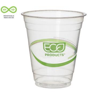
Figure 5 Eco-Products Inc GreenStripe® Cold Cup

Many clear compostable containers are consistent in appearance to each other as well as to the conventional noncompostable version of the container. Some manufacturers add labels or markings such as a green stripe<sup>14</sup> to differentiate containers though there is not a consistent labeling practice.