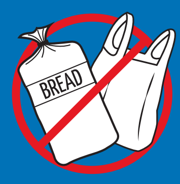
Plastic Bags & Overwrap